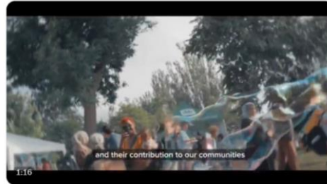
and their contribution to our communities

👑 We are proud to be the UK's first Borough of Sanctuary. lewisham.gov.uk/sanctuary